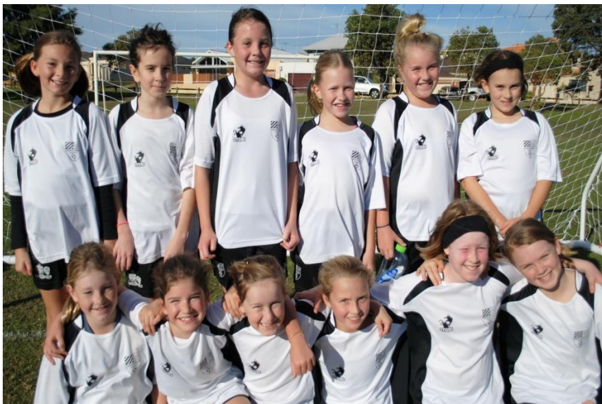
The Inaugural Under 11s Girls Team

The theme of this Newsletter has definitely been how the Club has grown tremendously over recent years and how we have had to accommodate this growth. One area of growth within the club that we are particularly pleased with is the number of girls that we have playing for our teams. Similarly it is pleasing to report that in addition to the girls that play alongside the boys within the younger teams, we can now boast to have no less than six girls only teams. The strength in numbers of our girls feeding through the age groups also means that the Hamersley Rovers Senior Club has had to create an additional Ladies team.